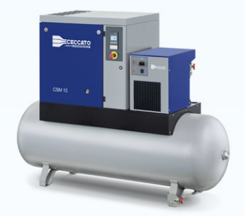
Use the AirCare app to control your Ceccato CSM oil-injected screw compressor.