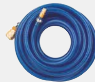
High pressure hoses