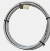
PA rolled pipe