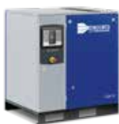
Floor Mounted version without integrated dryer