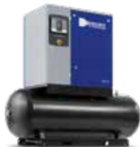
Tank Mounted version without dryer