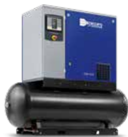
Tank Mounted version with integrated dryer