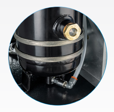
Oil heater Prevents intermittent-use condensation by maintaining a constant oil temperature while unloading/idle.