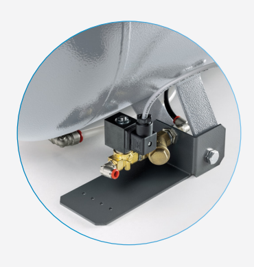
No-loss timer drain Removes tank condensate.