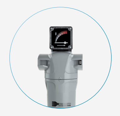
Line filter Can be added for high-quality air.

Thanks to its wide range of options and flexible build, the CSM 3-9 can accommodate all your requirements.