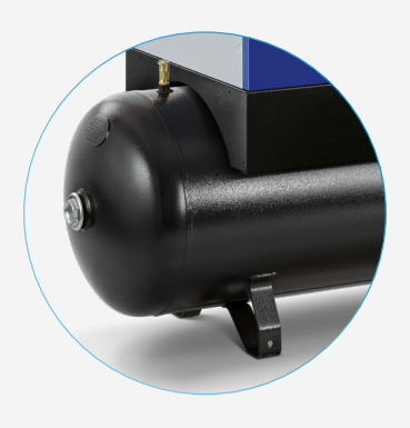
500-liter tank Gives you extra air storage and reduces the risk of condensation.