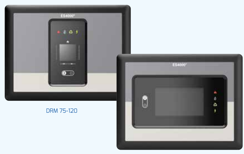
DRD 75-100 & DRE 120

Knowing the status of your compressed air system at any time improves the reliability of your overall operations. You can plan your service interventions at the right moment and avoid production downtime by detecting potential problems before they become a liability.